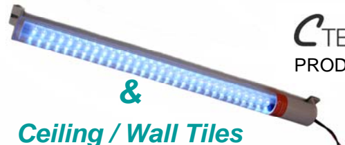
& Ceiling / Wall Tiles