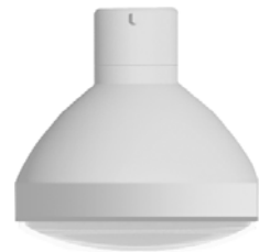
1 - 3 W High Power LED Lamps